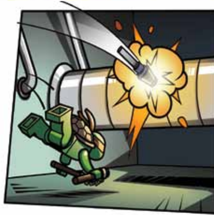
Panel 2 - Mikey skillfully dodges the missile, which strikes a huge water line in the lab. On the pipe, there is a large shut-off valve. Tons of water gushes out.