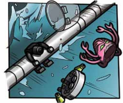
Panel 9 - Kraang slams into a low hanging water pipe, popping out of his brain bubble.