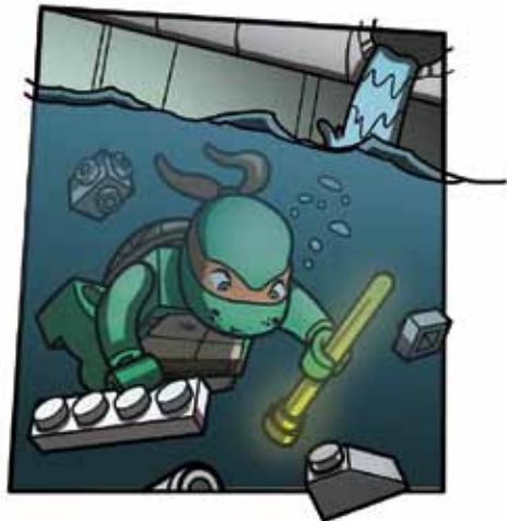
Panel 4 - Underwater shot of Mikey starting to construct something out of the bricks that are floating around him.