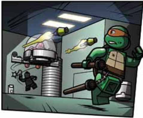
Panel 1 - The now flying Kraang fires a missile from his detached brain bubble towards Mikey who hasn't gotten too far away.