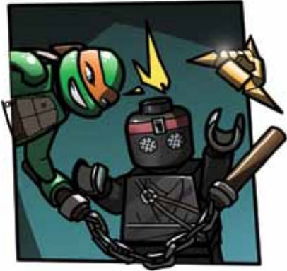
Panel 7 - Mikey's nunchucks strike the Foot Soldier's throwing star before he can throw it.