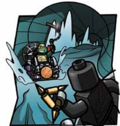
Panel 6 - Mikey is in hot pursuit of Kraang. The Foot Soldier who is holding onto him as they fly down the sewer tunnel, spots him and prepares to throw a shuriken. Mikey's fan boat is kicking up a huge rooster tail of water.