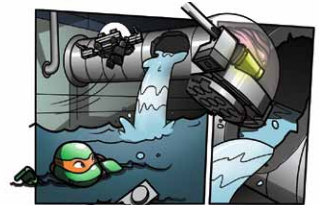
Panel 3 - The broken pipe has flooded the lab and the water level is rising. Amongst the floating LEGO bricks and ooze containers, only Mikey's head is visible. Kraang is escaping through the hole in the sewer pipe in the background with his Foot Soldier hanging on the back of his bubble.