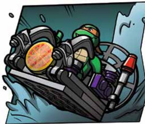
Panel 5 - Mikey in the fan boat breaches the surface dramatically.